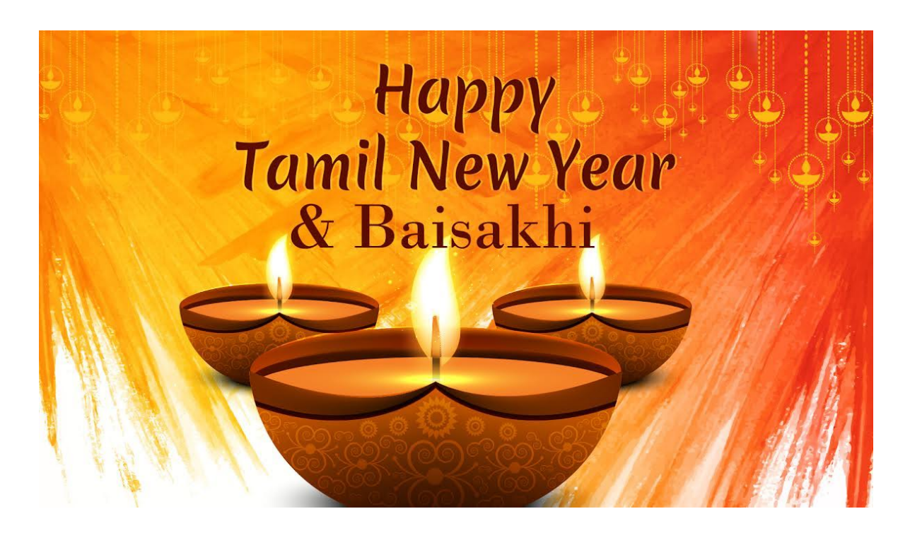
Happy Tamil New Year & Baisakhi